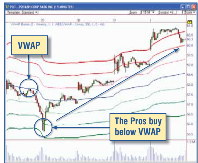
Price was clearly oversold in this chart of POT, and the VWAP Bands helped identify the zone where professional traders entered the market.

below VWAP (and selling above it) offers a great entry price that often leads to profitable trades.