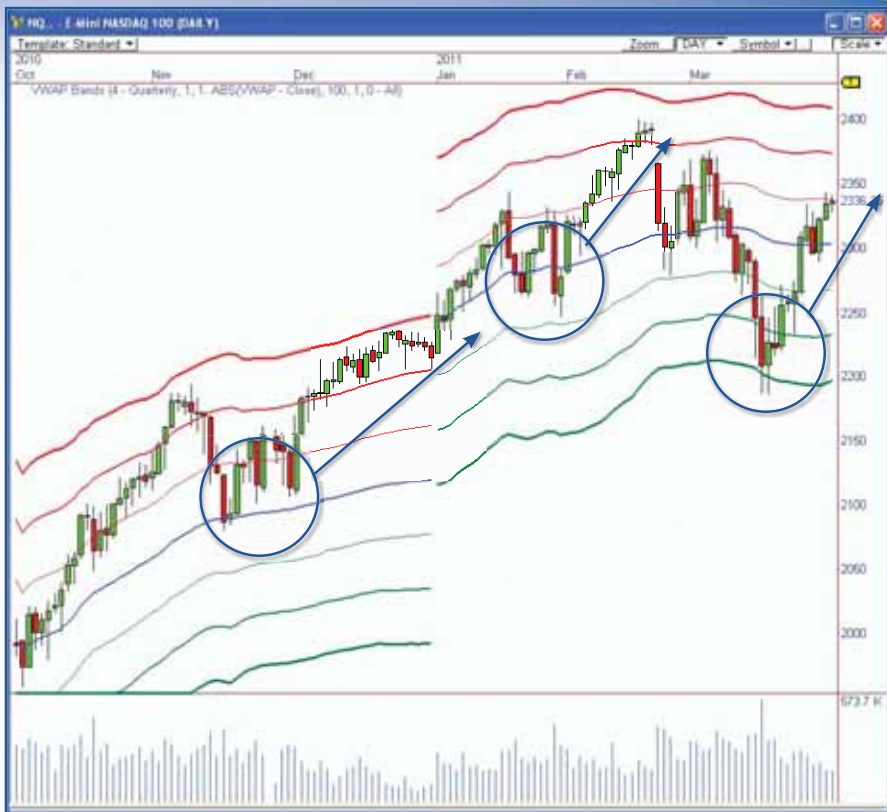
All VWAP indicators can be plotted in multiple timeframes. The quarterly VWAP Bands helped to identify the best buying opportunities in this daily chart of the E-Mini NASDAQ 100.

Including multiple timeframe analysis in your trading significantly increases your chances for success. Each timeframe is a call to action to different types of traders, and plotting and trading off multiple timeframe confluence zones allows you to pinpoint the best action areas in any chart!