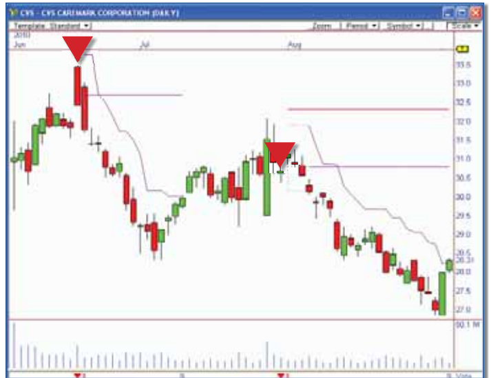
The VWAP Bounce EOD strategy generated two great sell signals that led to a total gain of 18%!