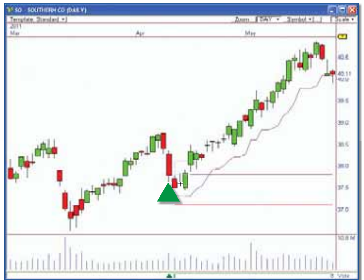
The VWAP Max Reversal EOD strategy helped identify an oversold condition in this chart of Southern Co., which led to a great buy signal.