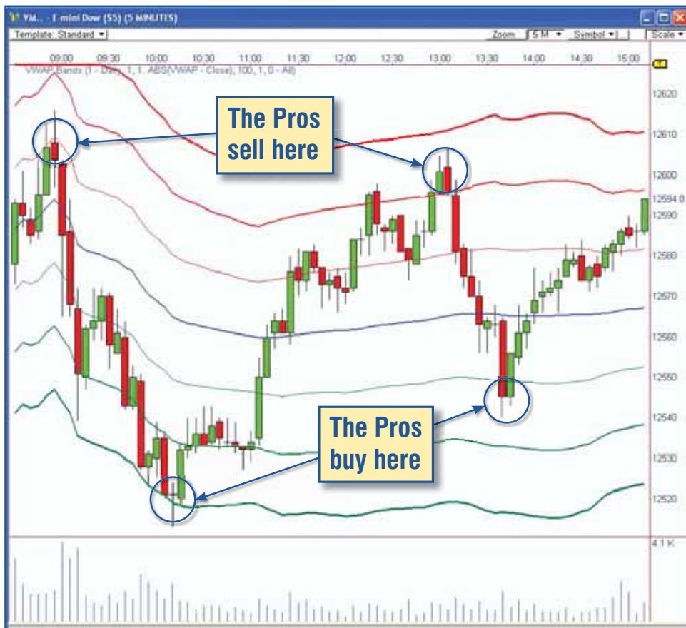
VWAP Bands help you uncover hidden areas of support and resistance in any chart.

While the bands help you to easily identify value situations, we've also created powerful strategies that will help guide you to trading success. And we're including trade plans that give you a versatile approach to trade management. ProfitBands is the trading dynamo that will help revolutionize the way you trade!