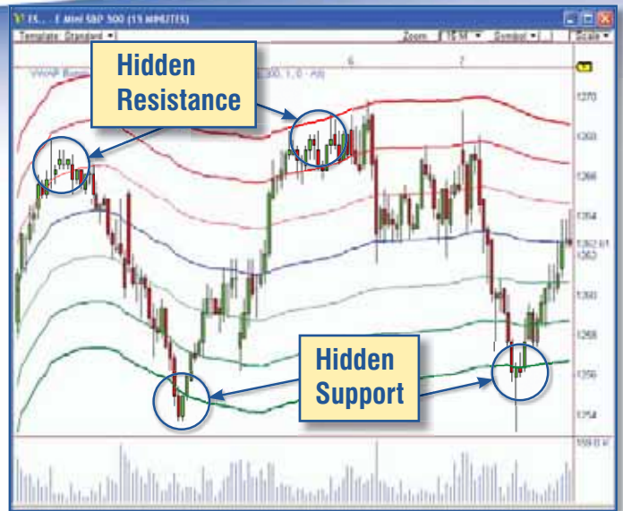
The weekly VWAP Bands helped identify every major turning point in this chart of the E-Mini S&P 500, revealing clear areas of overbought and oversold conditions.

We’ve harnessed the power of the VWAP indicator and made it easy to incorporate in your trading. The matrix (below) offers sound guidelines that professionals use when identifying trading opportunities with VWAP. Generally speaking, buying