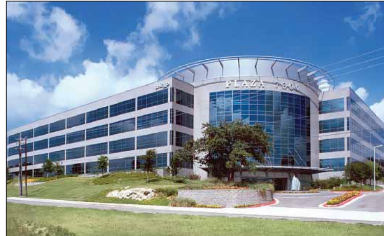
Nirvana Systems Inc., Headquarters in Austin, Texas

NSP-41 comes with OmniTrader Professional, our automated trading software platform AND our unmatched One-Year Guarantee! If you are interested in building wealth automatically, you owe it to yourself to learn more about NSP-41.