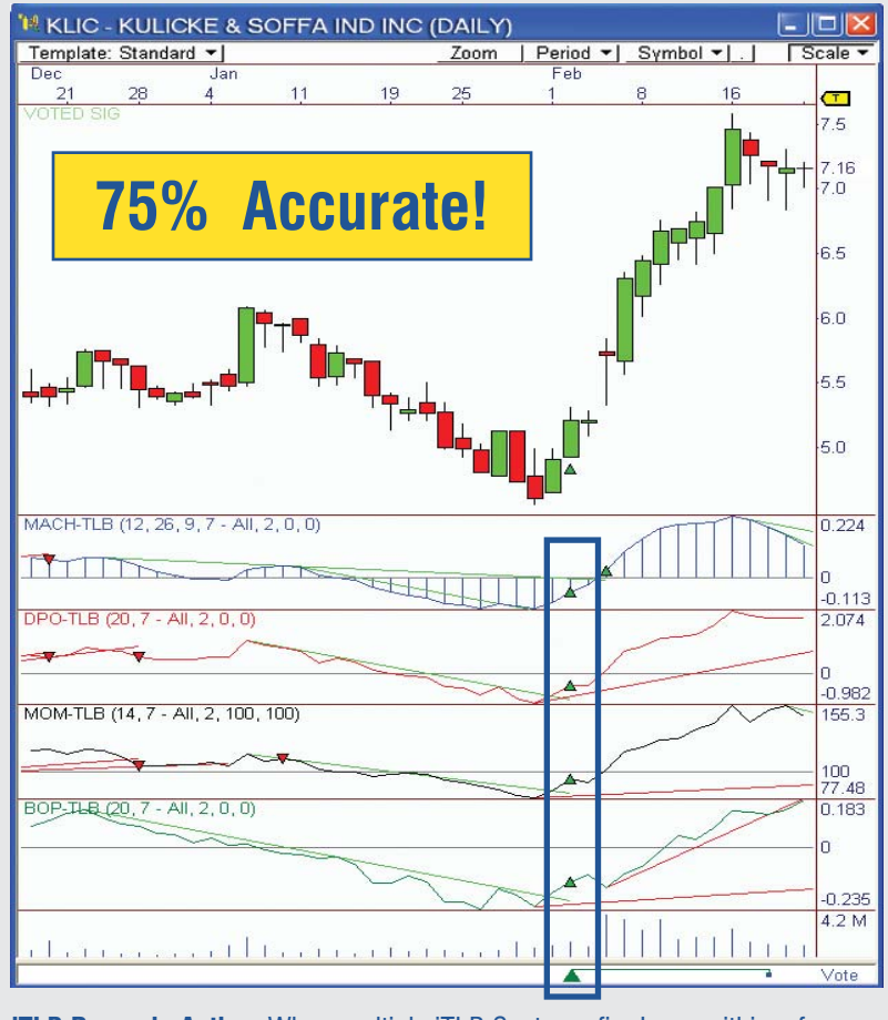
iTLB Power in Action. When multiple iTLB Systems fire Long within a few bars, a Long Signal is generated. A STRONG MOVE usually follows from this point, as shown in this chart for KLIC.

The iTLB2 Power Strategy is just another testament to the power of the iTLB concept. In the same way we used the iTLB Systems to create iTLB Power, you can use them to create your own Strategies in Strategy Builder. The iTLB package offers incredible value for our OmniTrader users. I guarantee you won't find ANY System that has shown itself to be this accurate or this profitable at this price.