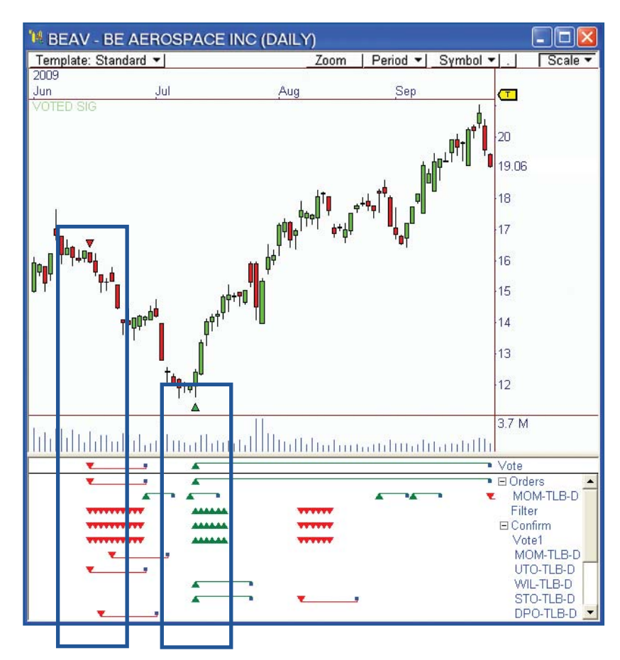
These Signals on BE Aerospace illustrate the iTLB Reversal Strategy . When multiple iTLB systems fire at the same time, there is usually a strong reversal indicated.

The iTLB 3.0 plug-in is a powerful addition for your OmniTrader tool box. The great thing about OmniTrader, of course, is you can activate these Strategies in addition to others you are already using to find the earliest confirmed reversals in your list. And iTLB finds them quicker than any other method!