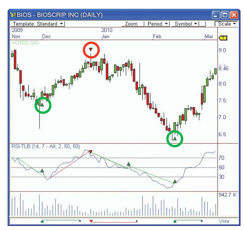
The RSI Trend Line Break (RSI-TLB) System: Sudden reversals in momentum are often indicative of a change in trend. Notice that most of these Signals occur on the earliest possible bar of the reversal.

But we only want to trade the best and "sharpest" reversals, which generally occur when Momentum and other indicators decisively break a prior trend. What is the best way to determine a sudden change in trend? A Trend Line Break, of course!